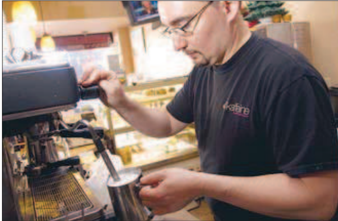
Kaffeine Espresso Bar, located at 18 Division St., New Rochelle.

Critics call this entertainment complex a magnet for crowds, noise and high prices. That said, expect an IMAX theater, go-karts, a skating rink, laser tag and an 18-hole glow-in-the-dark mini golf course in one place.