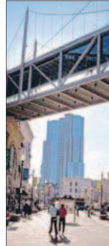
Take a stroll around the city of New Rochelle.