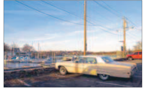
A view of a harbor in Hudson Park

There are a lot of new people coming to live in the condos. They're young professionals who work in