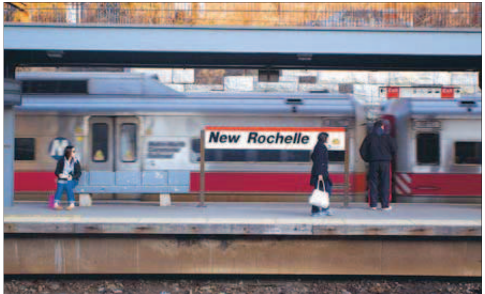
The commute to New York City is a cinch thanks to Metro-North Railroad.

But as with most towns in Westchester County, the city is still identified with families: This winter, Business Week named New Rochelle, with its median income of $89,684, among the top 40 "Best Places to