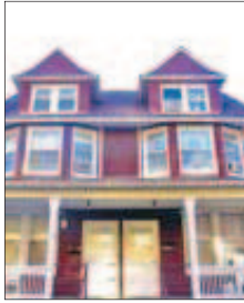
A suburban-style house on Church Street in New Rochelle

NEW ROCHELLE is bordered by the towns of Mamaroneck and Scarsdale to the north, Long Island Sound to the east, Eastchester to the west and Pelham to the south.